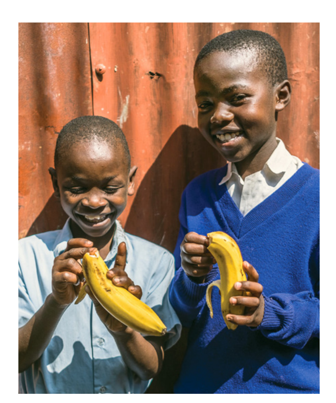
Two boys in Nairobi, Kenya eat bananas at Mwamko Children's Home, a community organization that receives food from Food Banking Kenya.